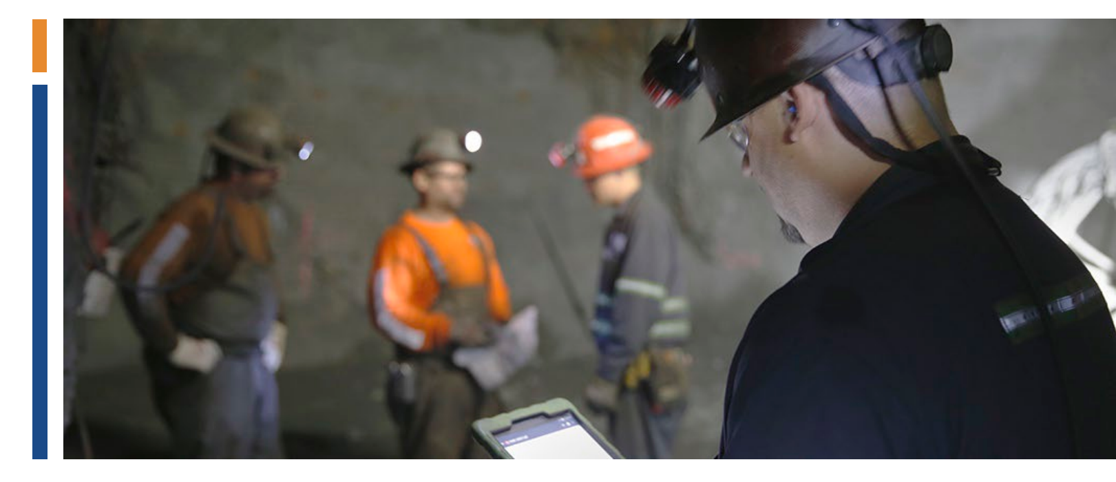
RESPONSIBLE. SAFE. INNOVATIVE.